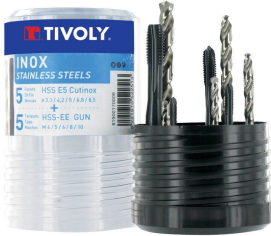
Taps 4x70 5x80 6x100 8x125 10x150 Drill bits Ø 3.3 4.2 5 8.5 mm Plastic case

A mixed case for drilling and threading Ideal for stainless steels.